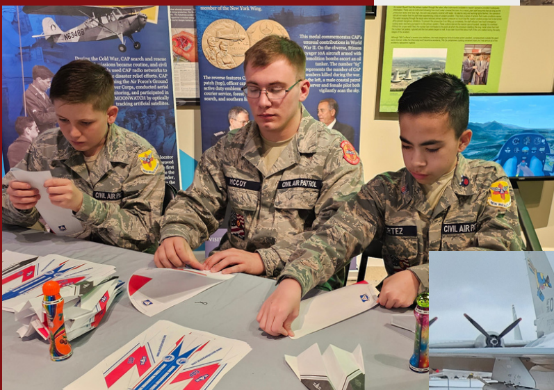
Cadets crafting paper airplanes