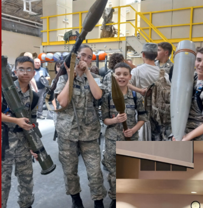
2023 December Winter Banquet

Sign-up Genius: https://www.signupgenius.com/go/409054AABAA2DA13-45088113-eclipse/149040608#/