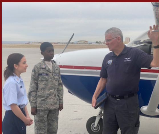
C/Aragon's first O-Flight.